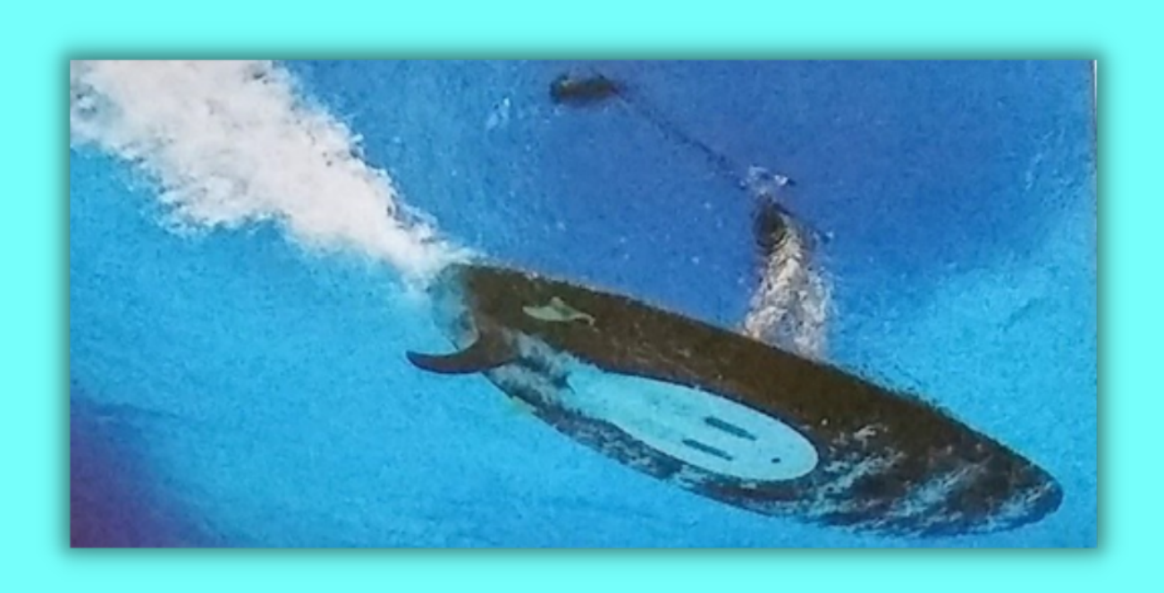
$50 | PER HOUR $75 | 2 HOURS