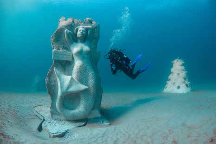
Modules like this one north of the Dania Beach Pier, will soon grace Hollywood Beach waters as part of a the 1000 Mermaids artificial reef project.

I am excited to work with the community on these issues and encourage you to reach out to me if there is something you would like to pursue with me.