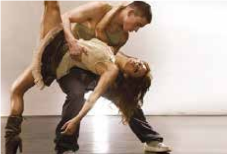
French Canadians are known for their signature ‘dip’ move when ending a dance routine.

ered quickly before they back up completely. A French Dip sandwich is just a small step toward a healthier diet for our visitors from north of the border. With the word