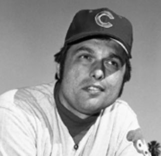
Pitcher Milt Pappas' lost 164 Major League games and his wife.