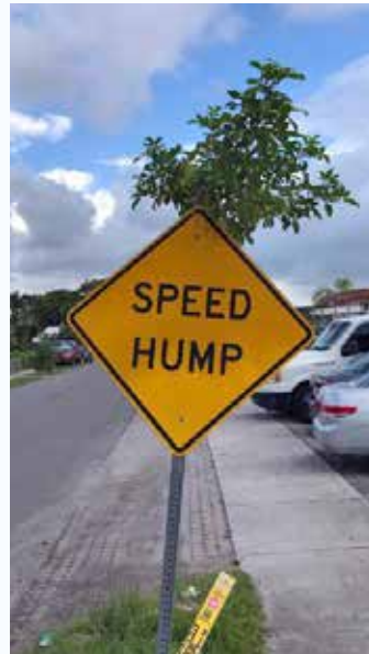
All SW Fifth Ct signs will remain but native vegetation will be planted to give area a 'green' environmental vibe to the proposed arts area

Unable to maintain the number of collections needed to keep the street clean from constant dumping, making the street an