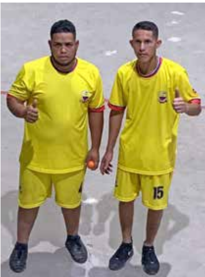
Hollywood has hired 30 new 'Thumbs Up' Rangers to promote positivity on the Boardwalk and beach.

Except in some middle eastern countries, a 'thumbs up' is a gesture of approval or encouragement and Hollywood has embraced it to make sure a day on the beach is a positive experience. "Visitors were giving us a big 'thumbs up' when we put the beach right next to the ocean," Hollywood spokeswoman, Tella Story, said, "and it just caught on from