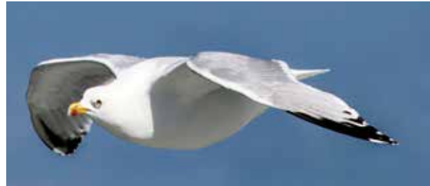
Sammy arrives on Hollywood Beach each July 23rd at 3:34 p.m. At a whopping 47 lbs. he's the world's biggest seagull

Much like the swallows of San Juan Capistrano and the chicken buzzards of Hinckley, Ohio, Hollywood Beach has its own airborne celebrity governed by Mother Nature's clock.