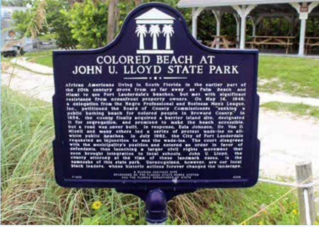
A marker notes the 'colored beach' established after protests in the 1940's.

The park offers boating and kayaking, fishing, picnic areas and space for large gatherings by reservation. Mizell-Johnson State Park is open 8 a.m till sunset daily at 6503 N. Ocean Dr. Dania Beach.