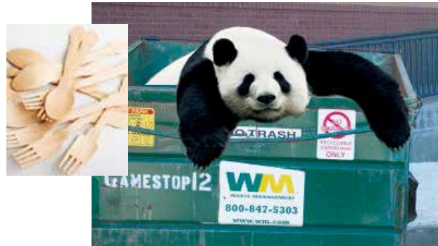
Use of bamboo utensils has caused a panda nuisance, with many of the animals rummaging through Dania Beach dumpsters.

Following in the footsteps of many Florida coastal cities, Dania Beach has been looking for alternatives to single use plastic tableware. Many towns have outlawed plastic