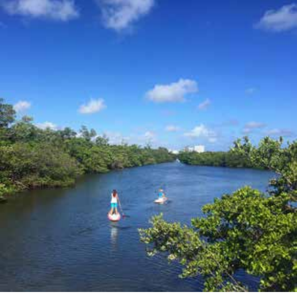
The Mizell-Johnson State Park is home to Whiskey Creek, popular with boaters and kayakers.