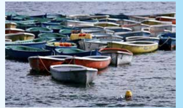
Lalanne will use his teeth to tow boats up the coast before catching a flight.

shouldn't be giving their kids milk. " Cow milk is good for baby cows not baby humans ," he said. His anti-milk comments led to the closure of numerous dairy farms around the country. Lalanne had a popular mail order business selling juicers, exercise routines and diets and his famous, 'Glamour Stretcher' to thousands of housewives who used the device to exercise (and Lord knows what else) along with the Lalanne family on TV. He encouraged men and women to lift weights at a time it was thought to make you muscle-bound .