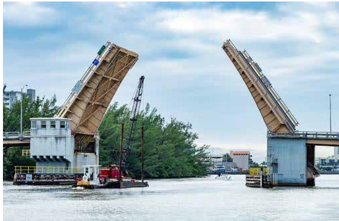
Sheridan Street Bridge has undergone many improvements during three month renovation

The Florida Department of Transportation (FDOT) spent three months this summer addressing issues with the Sheraton Street Bridge. Project improvements include installing bicycle-friendly / anti-slip walking plates along the moveable spans, removing the existing curb and adding a 4-foot traffic railing between the sidewalk and roadway, removing and replacing the outer pedestrian railing, adding new pedestrian gates in each direction, renovating the existing tender house, upgrading electrical and mechanical components, and access platforms on the bridge. We are proud of the new bridge and are glad it’s been completed before the annual tourist season.