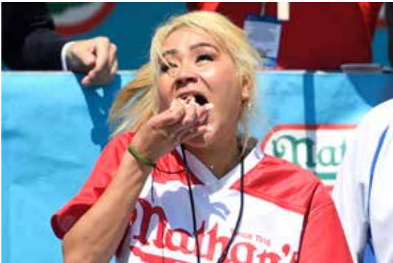
Miki Sudo and Joey Chestnut are reigning Nathan’s Hot Dog eating champions. They are headed to Hollywood to take on some dreaded fruitcake