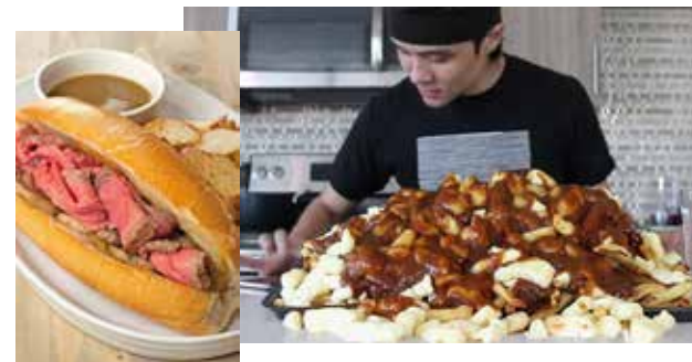
Philippe's French dip sandwich will attempt to replace poutine as the French Canadian meal of choice while in south Florida.

Philippe's , a Los Angeles dining institution since 1912, took 110 years to decide on a second location and finally picked downtown Hollywood, Florida. Known for being the birthplace of the French Dip Sandwich , Philippe's ownership checked out numerous United States sites