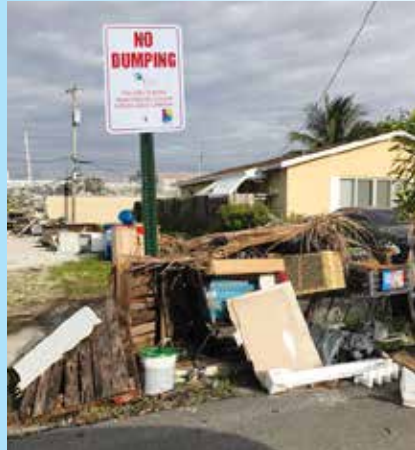
A Dania Beach street, home to constant dumping, has been designated a neighborhood art area

In an effort to fight blight in the neighborhood, Dania Beach has designated SW 5 th Court as an 'Artistic Expression District' . The short street off Stirling Road and just 'over the tracks' has been a dumping ground for many years with everything from