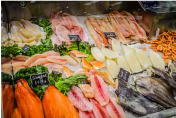
National seafood retailer, Neptune’s Best, has opened local store