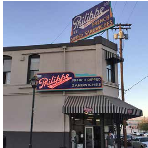
LA's Philippe's restaurant is opening a Hollywood location in hopes of improving the health of French Canadian visitors