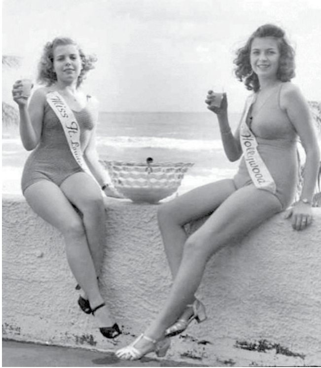
Miss Ft. Lauderdale and Miss Hollywood enjoy the beach in 1947