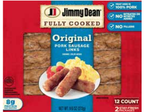
Jimmy Dean sausage is consumed by more than 100 million Americans and is considered the missing link to a great breakfast.

Dead or alive, The Jimmy Dean Museum is open daily in his hometown of Plainview, Texas . He was well known for his sausage in Plainview long before he became an entertainer and got in the pork business. Admission is free with the purchase of a Jimmy Dean T-shirt or any pork product in the museum's gift shop.