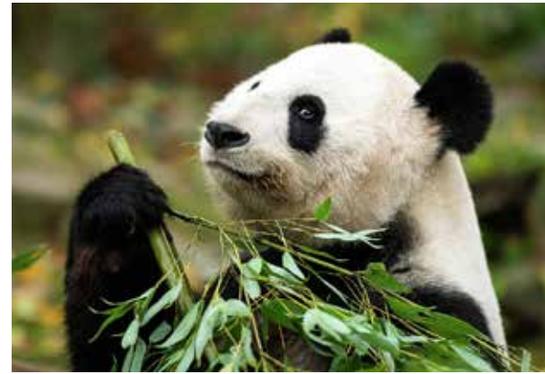
Bamboo is the food of choice for giant pandas

utensils and have switched to bamboo, a fast growing, sturdy and sustainable alternative that can be grown commercially. While bamboo has worked well in many municipalities, it has caused problems locally. With a modest giant panda population, Dania Beach has encountered problems with the loveable species of bear, digging through local trash cans for the bamboo spoons, knives and forks as well as boldly entering restaurants for the takeout goodies. "The Dania Beach pandas are shy animals and tend to hide out in the mangroves where there is a bamboo food supply," Ranger Rick Rackley , said, "but with the new source of biodegradable natural bamboo utensils in dumpsters the population is growing and they've become aggressive. They look cute and can be knife around people but when they're eating you don't want to fork with them."