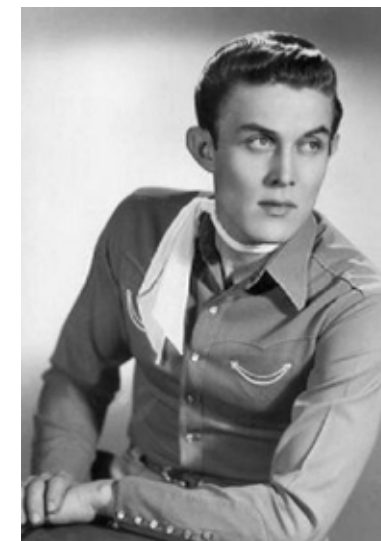
Declared dead in 2010, some claim Jimmy Dean is above ground and still doing sausage commercials.