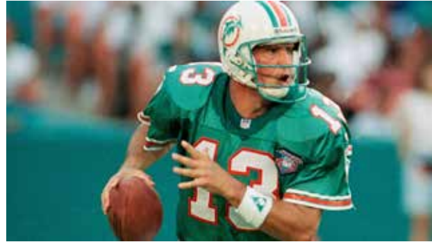
Dolphin legend, Dan Marino, threw 420 touchdowns during his 16-year Miami career.