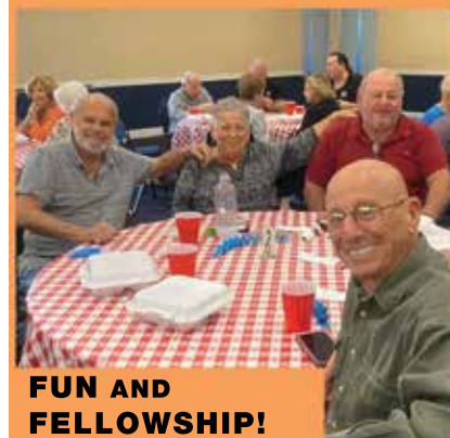
FUN AND FELLOWSHIP!

Meets @ 9:30AM FIRST THURSDAY of Every Month