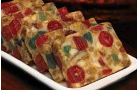
Considered colorful but almost uneatable, fruitcake will be featured at competitive eating event on Hollywood Beach

Fruitcake is new to the competitive eating circuit governed by the International Federation of Competitive Eating (IFOCE) which sponsors over 100 major eating events annually. “Fruitcakes have the reputation of tasting horrible,” Husky added, “To be able to choke them down in any quantity is a daunting task but competitive eating is so popular there weren’t many foods that haven’t already been covered at IFOCE events. We really only had a food choice between possum snouts and fruitcake. I’ve had the snouts and they’re delicious but possums can be tough to catch unless they’re playing possum and getting enough noses for a field of 12 competitors in both the men’s and women’s division would be tough.”