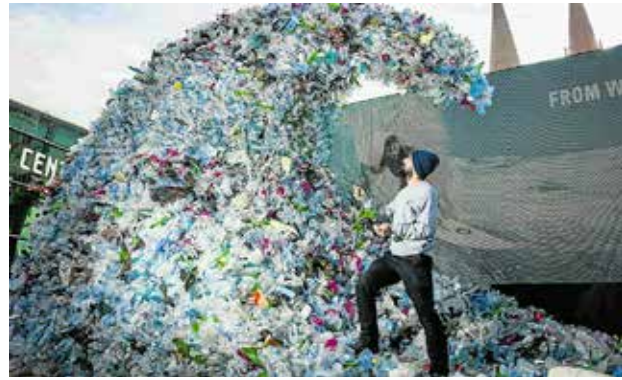
The Westside Wave is the first sculpture made from SW 5th Court trash with main components being plastic bags and bottles.