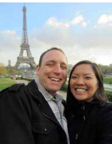
Joey Chestnut’s profession made romance impossible for former girlfriend