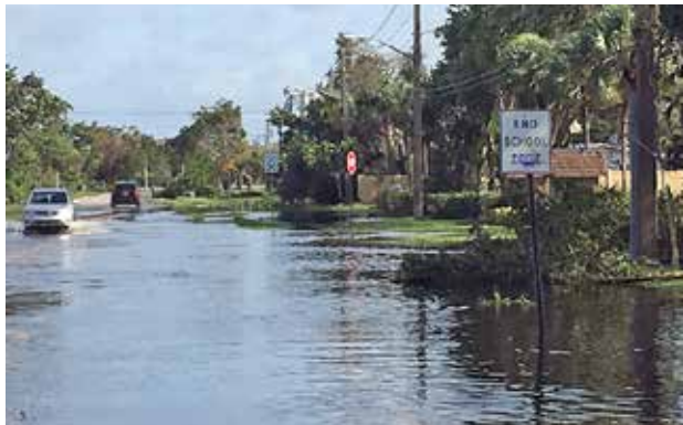
Frequent flooding is an ongoing Dania Beach concern

Assistant City Manager Candido Sosa Cruz recently met with Hollywood officials to discuss possible public transportation alternatives. Is Dania Beach looking to a 'trolley' type system to help ease traffic?