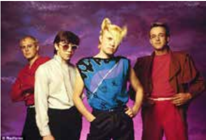
British hitmakers, Flock of Seagulls, will give a free concert at next year's Sammy Fest.

Sammy is also a 'bird of interest' in the disappearance of six children but with all the worldwide publicity he brings Hollywood Beach, the city is willing to sacrifice a kid every now and then.