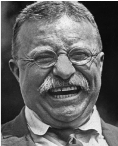
Was Hollywood's Roosevelt Street named after Teddy or Franklin?

Is Roosevelt named for Teddy or Franklin