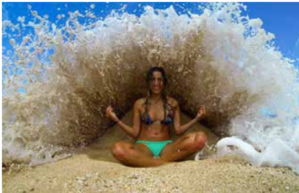
The Wave Cave virtual amusement ride has opened for adventurous beach goers.