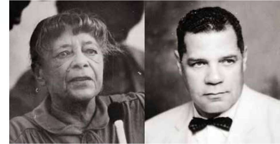
State Park was renamed the Dr. Von D. Mizell-Eula Johnson State Park in 2016