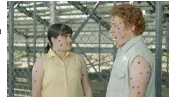
Skittles acne brought this handsome couple together in weird TV spot