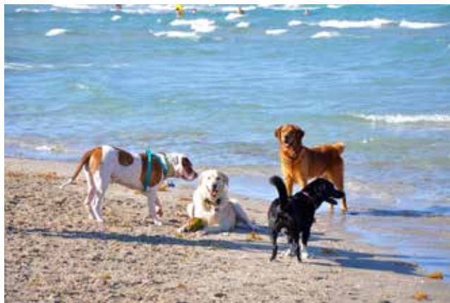
The Hollywood Dog Beach is now accessible every day to mutts and their masters.