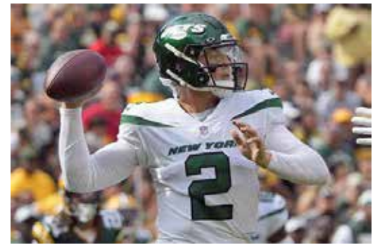
Jets quarterback, Zack Wilson, has matured as a football player and as a man.

The New York Jets have been criticized for a lack of offense but scoring off the field doesn't seem to be a problem for second year quarterback, Zack Wilson .