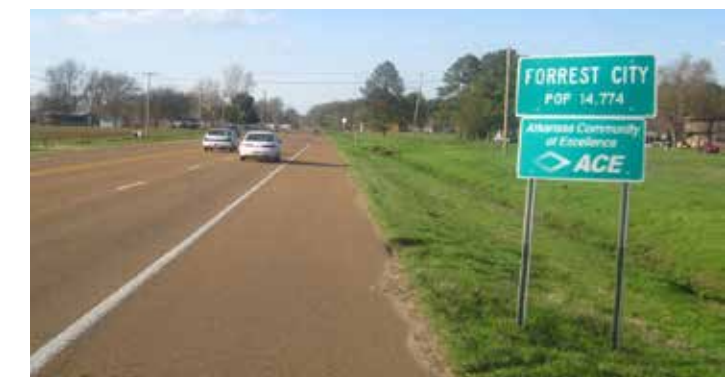
Hollywood city officials are headed west to convince Arkansas town to change its name.