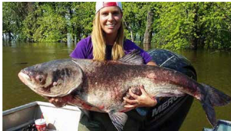
The Asian carp will from hereon be known as the Grass carp or Copi Carp.

The name ban (spoken and written) goes into effect January 1, 2023 with first time offenders using the Asian Carp term receiving warnings with a second offense fineable up to $250. Some anglers have questioned the need for this new regulation and believe Fish and Game officials are being Koi about the name change.