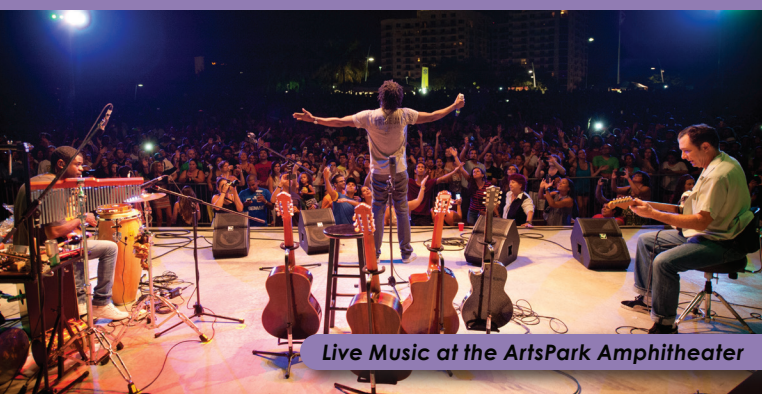
Live Music at the ArtsPark Amphitheater

Unique arts and entertainment attraction offering art exhibits, glassblowing and metalworking classes, and demonstrations for people of all ages. One Young Circle • 954-921-3500 • HollywoodFL.org